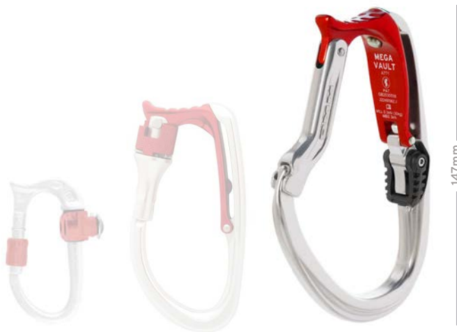
› Micro Vault