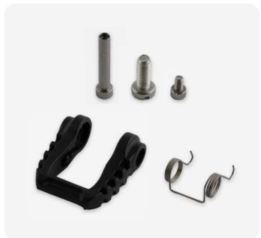
› Mega Vault Spares Kit